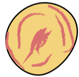
Day 0: Imbibed cotyledons with embryo inside